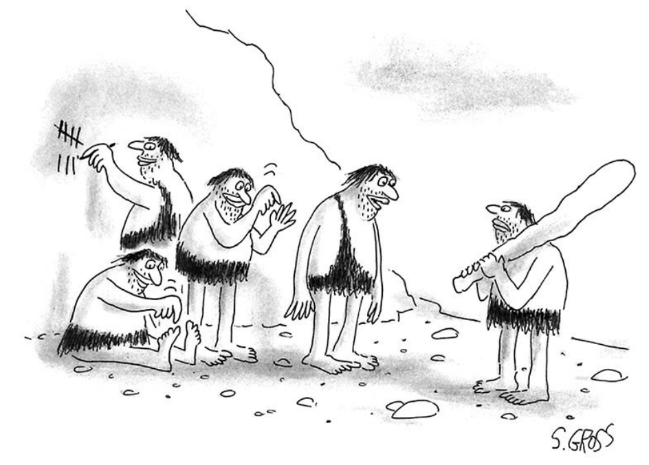
"We are neither hunters nor gatherers. We are accountants."