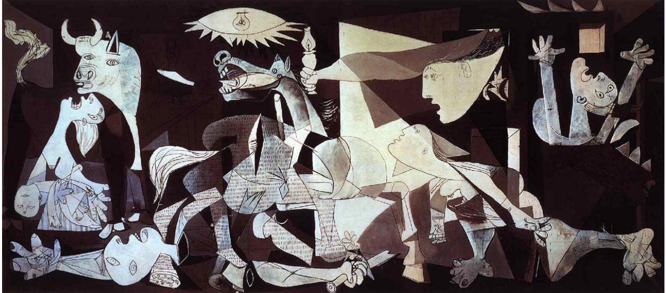
Pablo Picasso, Guernica , 1937, oil on canvas, Museo Reina Sofia, Madrid