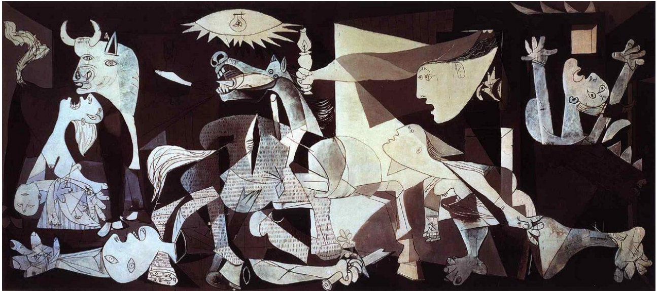
Pablo Picasso, Guernica , 1937, oil on canvas, Museo Reina Sofia, Madrid