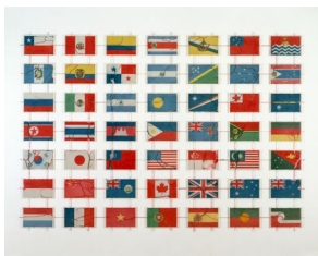
Yukinori Yanagi, Pacific , 1996. 49 perspex boxes, plastic tubes and artificial sand. 2820 x 4050 x 18 mm. Tate Modern, London