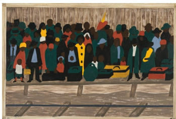
Jacob Lawrence, "And the migrants kept coming", Panel 60 from The Migration Series , 1940–41. Casein tempera on hardboard, 12 x 18 in. The Museum of Modern Art, New York