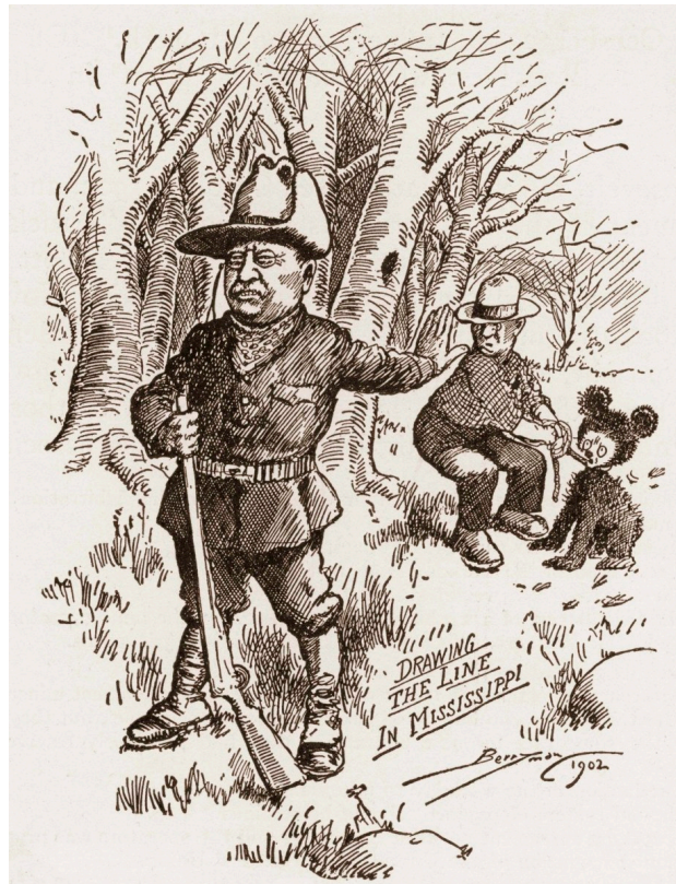
Washington Post , Nov. 16, 1902

You are free to choose a paper topic within American history (1500s-2000s) or modern European history (1700s-2000s) so long as your central focus is an organism or a virus . All topic proposals are subject careful scrutiny and revision.