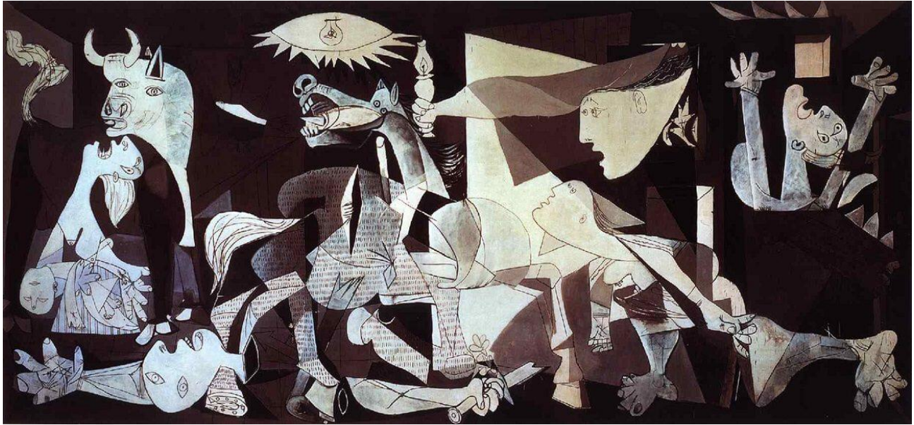
Pablo Picasso, Guernica , 1937, oil on canvas, Museo Reina Sofia, Madrid