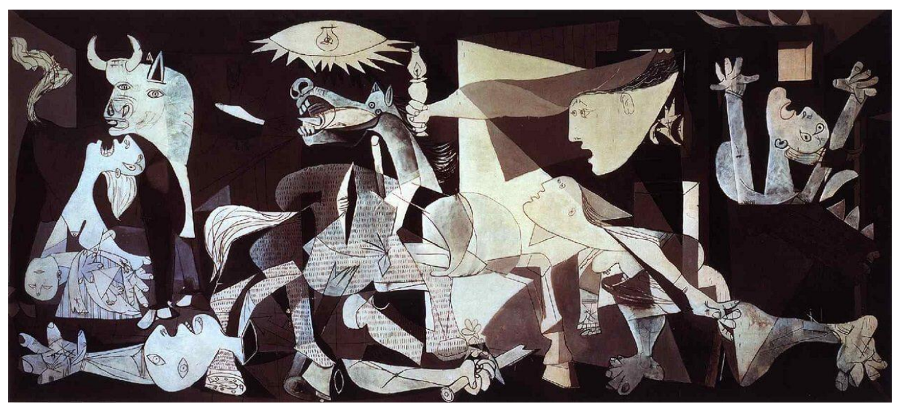
Pablo Picasso, Guernica, 1937, oil on canvas, Museo Reina Sofia, Madrid