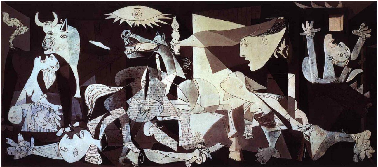
Pablo Picasso, Guernica , 1937, oil on canvas, Museo Reina Sofia, Madrid