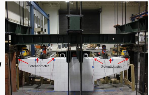
CFRP Post-tensioned Pier Cap