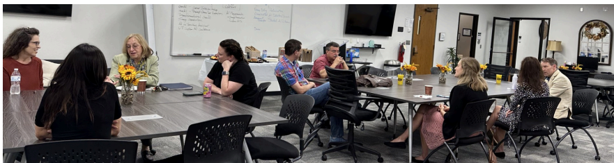
At the beginning of the fall semester, ADT hosted a welcome-back kick-off.

ADT hosted a networking breakfast to celebrate the end of the semester. It was a huge success!