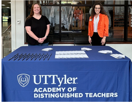
Inaugural Faculty Resource Table at the 2024 New Faculty Orientation