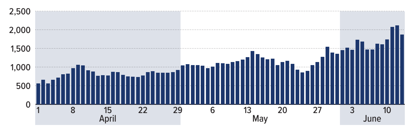
Figure 2. New Cases of COVID-19 by Day in the State of Texas (April 1 – June 14)

Note: Daily figures are adjusted with a five-day moving average.