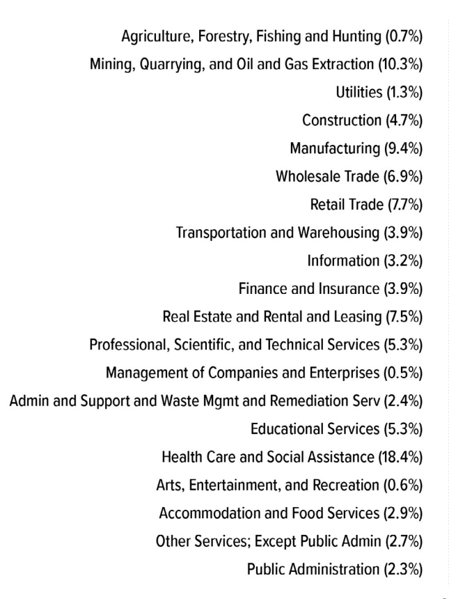
Figure 2. Gross Domestic Product Percent Change in Tyler Between 2019 and 2020 by NAICS Industry Sector

The COVID-19 recession widely impacted the different sectors of the economy. In general, those sectors that depend on the movement of people were severely affected, while those sectors that depend on the movement of information were relatively unscathed. Thus, the economic impact of the community was greatly determined by the composition of its economy and the interaction among its industry sectors in Tyler. Figure 2 depicts the detail of the 20 NAICS industry sectors. In parethesis we provide the share of each industry to the overall local economy. A pronounced drop in an industry with high percent share would result in a larger loss to the economy.