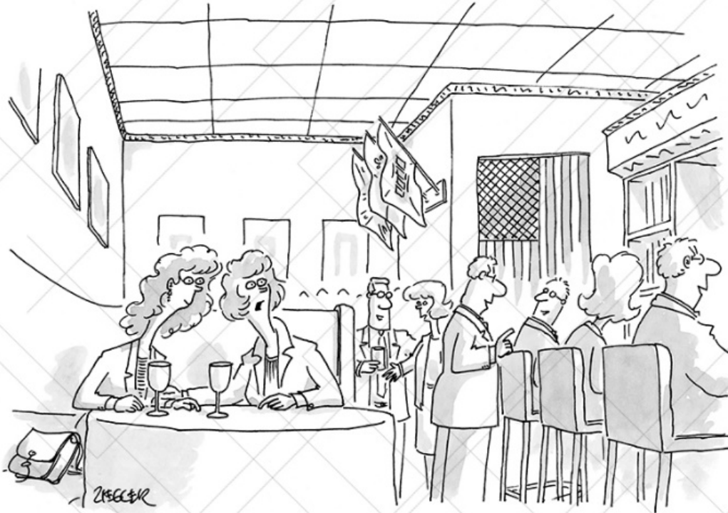
"Being an accountant gives him that extra aura of danger."