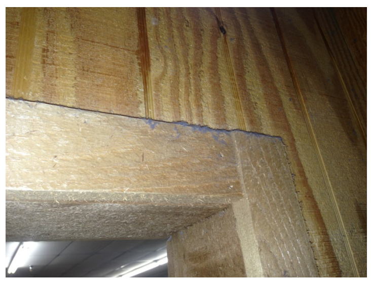
(Cavender's Tyler 3/25/13 11A.M.)