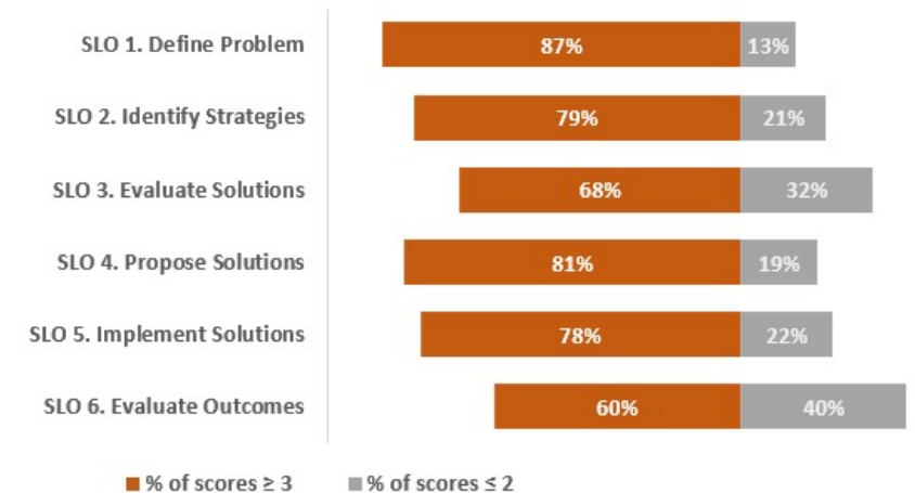
QEP Pilot Study Results